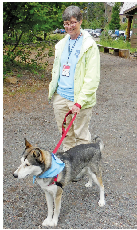
SELINA AND POET

LYDA applications are available each fall online at sibend.org . Women who are pursuing their education, financially needy, head of household and enrolled in a certificated educational program are encouraged to apply. A separate local Soroptimist Live Your Dream Award is underwritten by Central Electric Cooperative for women who meet the above criteria and who are CEC members in good standing.