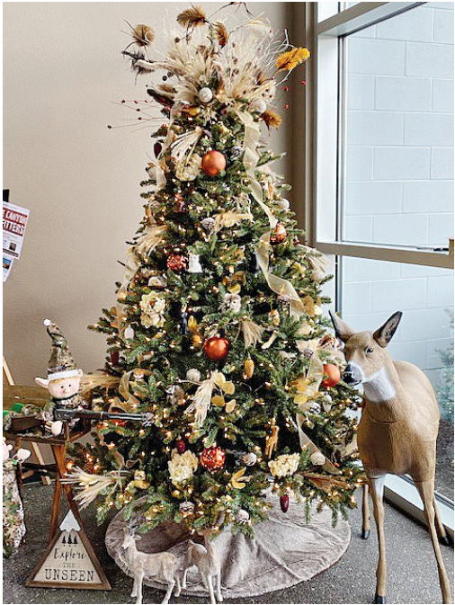
ROSENDIN DONATES TREE AND GIFTS FOR ST. CHARLES FOUNDATION HOSPICE AUCTION

The Hunting for Help-themed tree package, valued at $5,400, also includes a guided fishing trip with Jeff Daniels Guide Service, custom Upland Bird Hunting package with Sage Canyon Outfitters, Vortex binoculars and Binopack and plenty of camping and hunting equipment including a BOMKI Cuisinart charcoal smoker, Yeti Tundra cooler, Vortex laser rangefinder, Sitka Gear hunting pack, walkie talkies, lanterns, camping stoves and more.