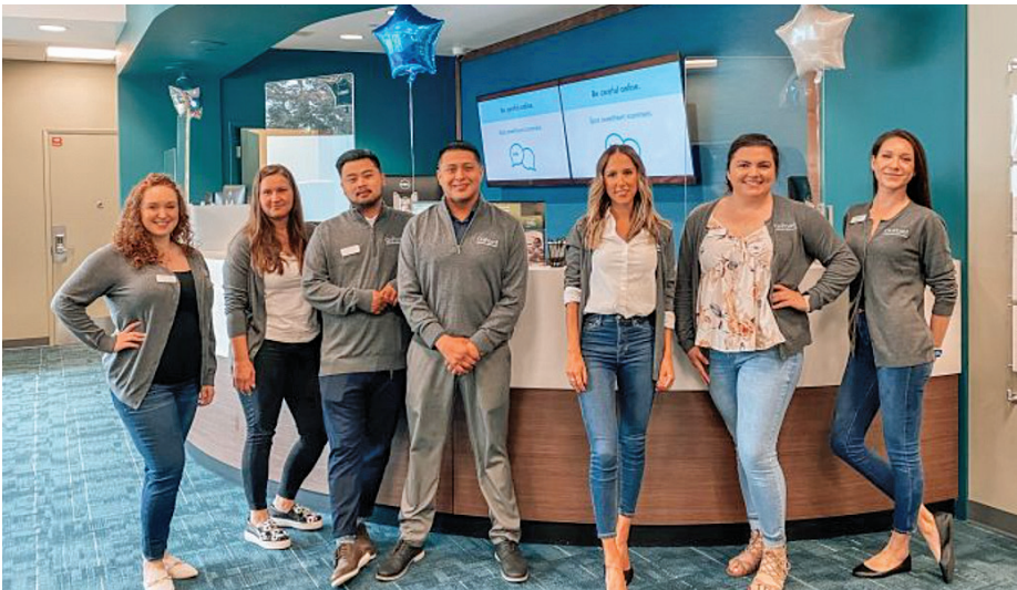
JOHNSON CREEK FRED MEYER BRANCH EMPLOYEES

The Portland Business Journal recently named OnPoint Community Credit Union one of Oregon's Most Admired Companies, ranking second in the financial services category. This honor marks OnPoint's 14th consecutive year as one of the state's most admirable credit unions, banks or wealth management firms. The annual list of honorees evaluates companies across all industries based on innovation, branding and marketing, quality of management, community involvement and quality of products and services.