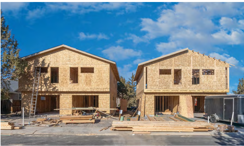
WATERCRESS TOWNHOMES UNDER CONSTRUCTION