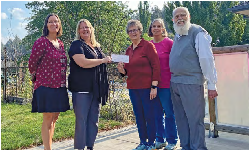
K.I.D.S CHECK PRESENTATION | PHOTO COURTESY OF FAMILY ACCESS NETWORK