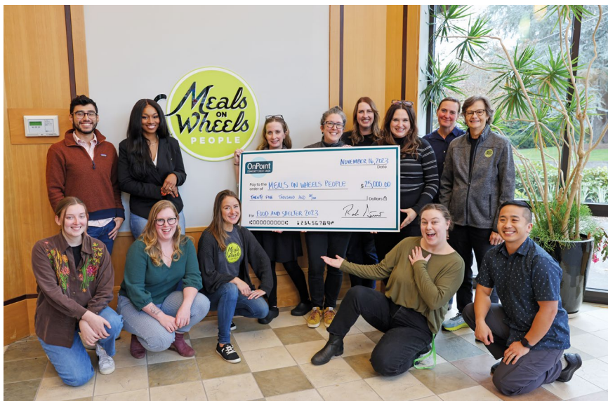
MEALS ON WHEELS