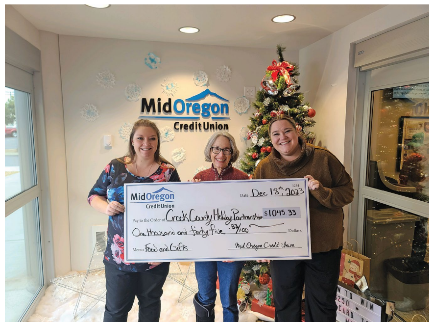
(ABOVE) CROOK COUNTY HOLIDAY PARTNERSHIP CHECK PRESENTATION, (RIGHT) LA PINE CHRISTMAS BASKET ASSOCIATION CHECK PRESENTATION

Since 2013, Mid Oregon members and the community have donated $43,800 to local food banks through Holiday Dough — helping to bring holiday cheer to local families.