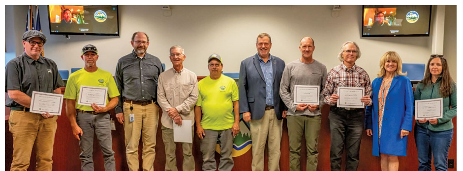
2024 SAFE SIDEWALKS AWARD WINNERS WITH DESCHUTES COUNTY BOARD OF COMMISSIONERS

Winners were recognized at the ALGA Annual Conference in Seattle on May 6.