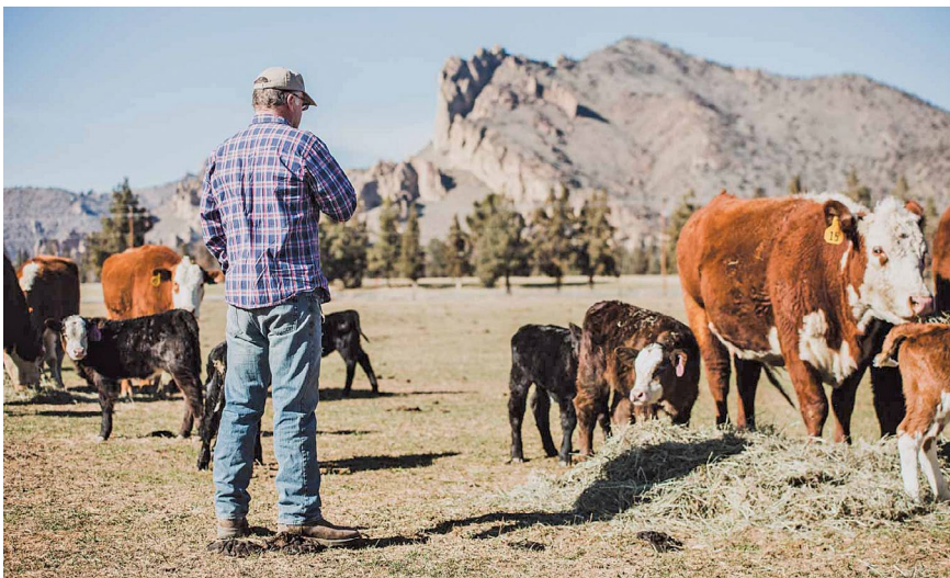
DD RANCH