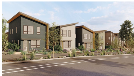
ROOTED AT SIMPSON | RENDERINGS COURTESY OF TEN OVER STUDIO

Project Owner: Children's Museum of Central Oregon Project Address: Bend Sq. Ft. Approximately 25,000 Contractor: TBD Estimated Completion Date: 2027-2028 Brief Description/Amenities: A proposed museum to provide