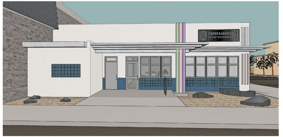
RENDERING | COURTESY OF HD ARCHITECTURE

Remodel of long-vacant building in downtown Bend to house expansion of addiction treatment services for Pfeifer & Associates.