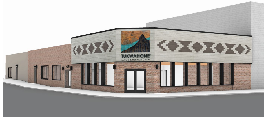
TUKWAHONE' DOWNTOWN CENTER | RENDERINGS COURTESY OF BBT ARCHITECTS