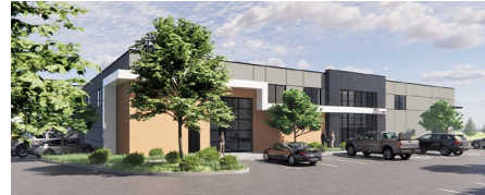
HAYDEN HOMES CORPORATE HEADQUARTERS AND SERVICE CENTER

Project Owner: Hayden Homes Project Address: Redmond, Oregon Sq Ft: 34,896 Budget: Confidential Contractor: Sun West Builders Estimated Completion Date: Spring 2025