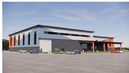
INTERCHANGE - COGA

Project Owner: J&J Bailey Holdings LLC Project Address: 63330 N Hwy. 97, Bend Sq Ft: 22,825 sq. ft. Contractor: Empire Construction & Development Estimated Completion Date: Spring 2026 Brief Description/Amenities: New indoor skatepark recreational facility in the proposed Basecamp Campus located near the Hwy. 20 and Hwy. 97 interchange.