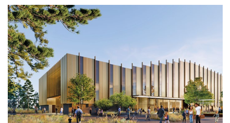
DPL STEVENS RANCH-1 | RENDERINGS COURTESY OF STEELE ASSOCIATES ARCHITECTS

Project Owner: Deschutes Public Library Project Address: 600 NW Wall St., Bend Sq Ft: 34,000 +/- sq. ft. Budget: $15M Contractor: Kirby Nagelhout Construction Company Estimated Completion Date: 2026 Brief Description/Amenities: Library renovation to serve the citizens of Bend and Deschutes County.