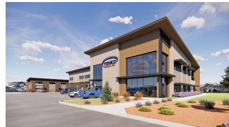
TOMCO ELECTRIC

Tom McCall Retail/Office Bldg Project Owner: Empire Construction & Development Project Address: TBD Sq Ft: 9,900 sq. ft. Contractor: Empire Construction & Development Estimated Completion Date: Fall 2025 Brief Description/Amenities: New speculative retail/office building in Prineville in the Tom McCall Business Park for future tenants.