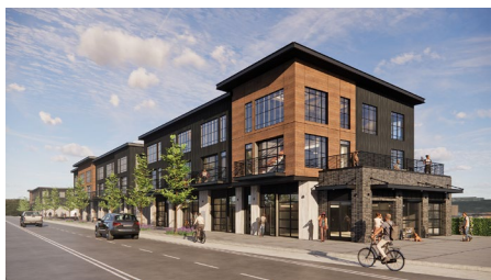
BLACK DIAMOND LOFTS

Project Owner: Aaken Electric Sq Ft: 12,300 sq. ft. Contractor: Empire Construction & Development Estimated Completion Date: Fall 2025 Brief Description/Amenities: New headquarters office and warehouse.