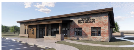
OREGON DEPT. OF FISH AND WILDLIFE JOHN DAY WATERSHED ADMINISTRATION BUILDING

New school integrated into existing campus. The building features a state-of-the-art performing arts theater that will also serve as a church sanctuary.