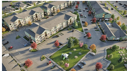
THE ARGYLE AT SOUTHRIDGE | RENDERINGS COURTESY OF SĀJ ARCHITECTURE

The site includes a new administration building and planning for a future 4,000-square-foot shop and vehicle maintenance space. The design team also developed building design aesthetics for use on facilities throughout the Northeast and Southeast ODFW regions.