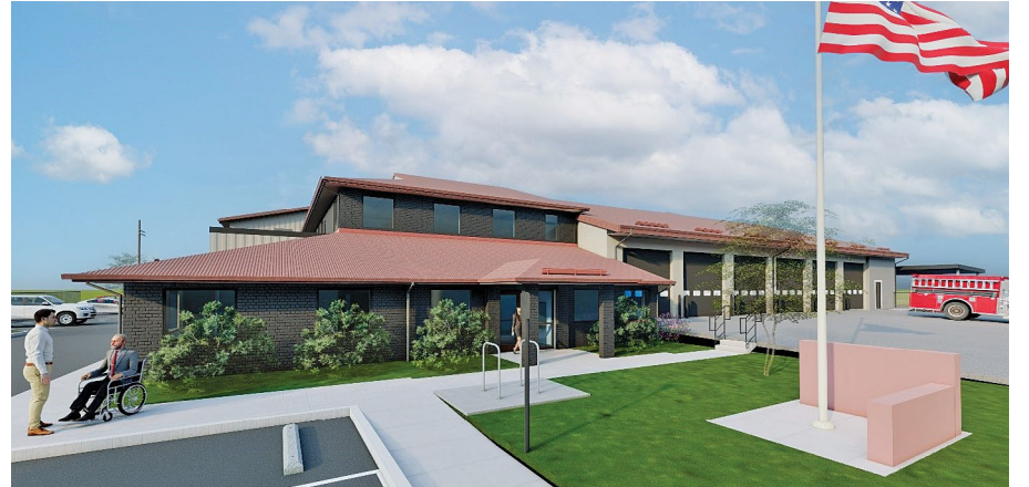
JEFFERSON COUNTY FIRE & EMS EXPANSION AND SEISMIC UPGRADE