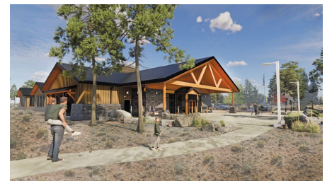
USFS SISTERS RANGER DISTRICT COMPOUND - ADMIN BLDG

Contractor: Empire Construction & Development Estimated Completion Date: Fall 2025 Brief Description/Amenities: New headquarters office and warehouse for Tomco Electric.