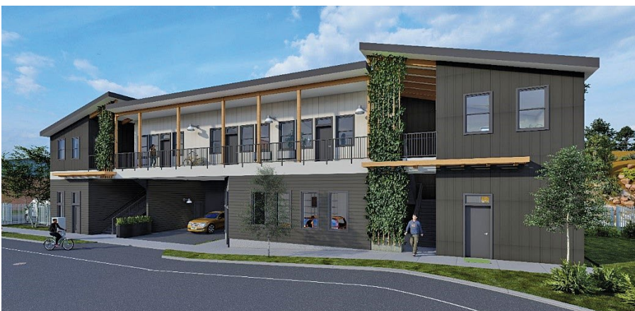
1ST STREET MIXED-USE WORKFORCE HOUSING

Project Owner: Housing Works Project Address: 19755 Simpson Ave, Bend, OR 97702 Sq Ft: 58,307 sf Contractor: R&H Construction Estimated Completion Date: Fall 2025