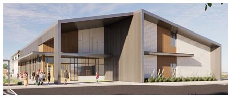
TRINITY LUTHERAN MIDDLE AND HIGH SCHOOL

This career-focused project will provide a hub for students throughout Southwest Washington as they learn about and explore the surrounding forest. Nestled into the district's 30-plus-acre property, the initial building will offer flexible spaces where students can gather before setting off on assignments and reconvene to share their findings. The outdoor learning facility is a partnership between Kalama School District and Cascadia Tech Academy.