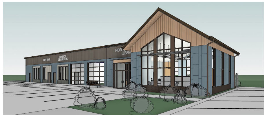
NORTH POWDER PUBLIC LIBRARY ADDITION

Project Owner: U.S. Bureau of Indian Affairs Project Address: 2144 Kota St, Warm Springs, OR 97761 Contractor: Sealaska Construction Estimated Completion Date: Winter 2026