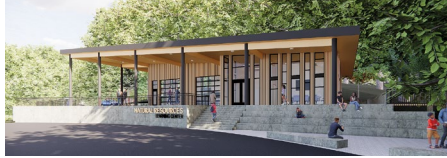
KALAMA SCHOOL DISTRICT NATURAL RESOURCES LEARNING FACILITY

This remodel and multiphase expansion will help the QWC offer expanded health and wellness services to the local community.