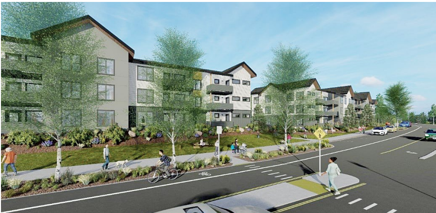
COLLEGE VIEW AFFORDABLE HOUSING

Project Owner: Homes for Good Project Address: 599 E Broadway, Eugene, OR 97401 Sq Ft: 32,000 sf Contractor: Meili Construction Estimated Completion Date: Fall 2025