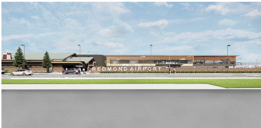
RENDERING | COURTESY OF HENNEBERY EDDY ARCHITECTS