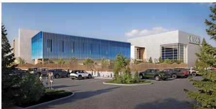
CHILDREN'S MUSEUM OF CENTRAL OREGON