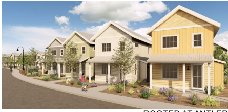
ROOTED AT ANTLER