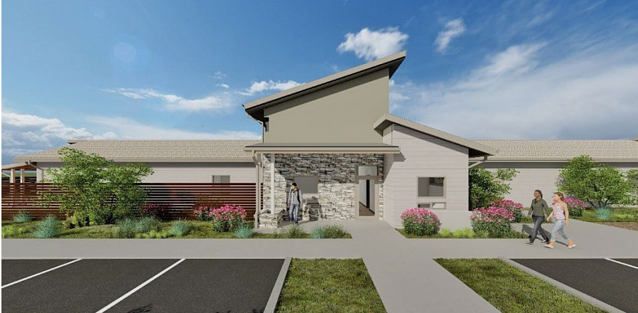
KLAMATH BASIN RESIDENTIAL TREATMENT CENTER AND CRISIS STABILIZATION CENTER

Project Owner: Community Counseling Solutions Project Address: 361 Turner Ct NE, Boardman, OR 97818 Sq Ft: 12,855 sf Contractor: Kirby Nagelhout Construction Company Estimated Completion Date: Spring 2025