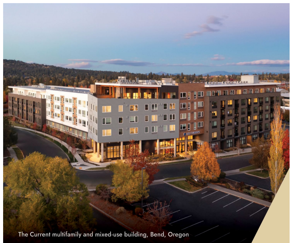
The Current multifamily and mixed-use building, Bend, Oregon