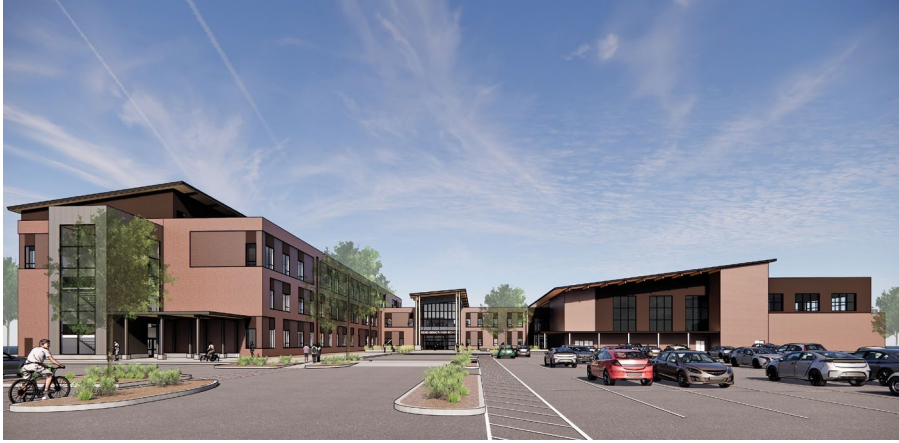
BEND SENIOR HIGH SCHOOL