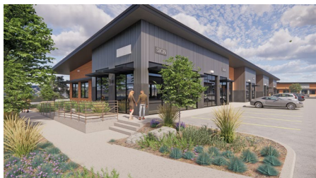
JUNIPER RIDGE LOT 6