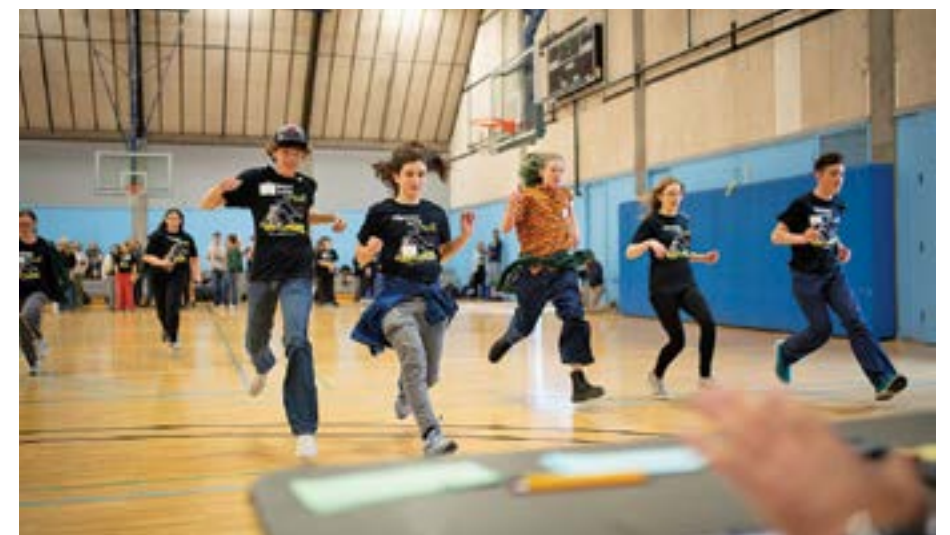
MORE THAN 150 HIGH SCHOOL STUDENTS WILL CONVERGE FOR THE CONTEST